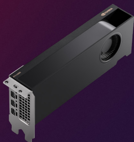
NVIDIA RTX™ A2000 Graphics Card

For a full list of accessories and options, please visit: accsmartfind.lenovo.com